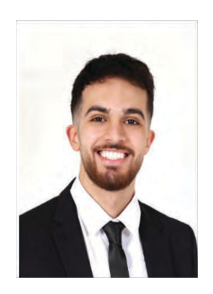
Abdullah Al-Ahami Royal College of Surgeons – Bahrain